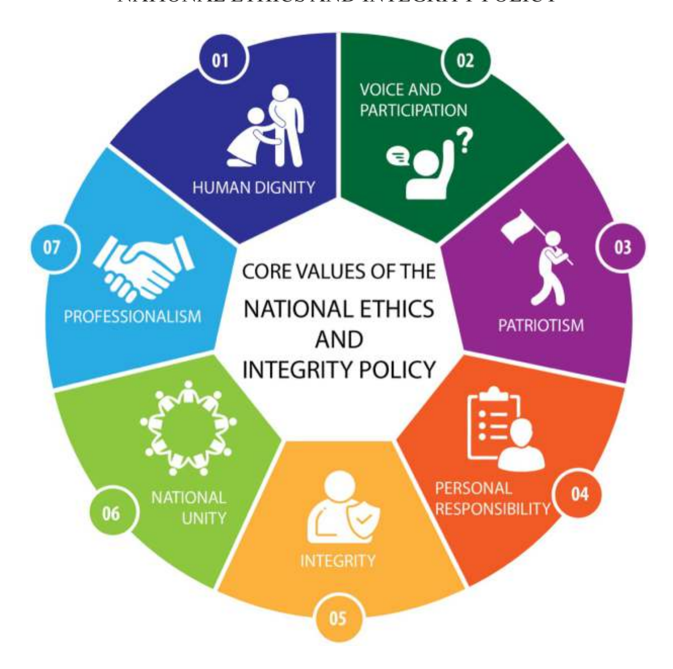
SECTION 4: THE CORE VALUES OF THE NATIONAL ETHICS AND INTEGRITY POLICY